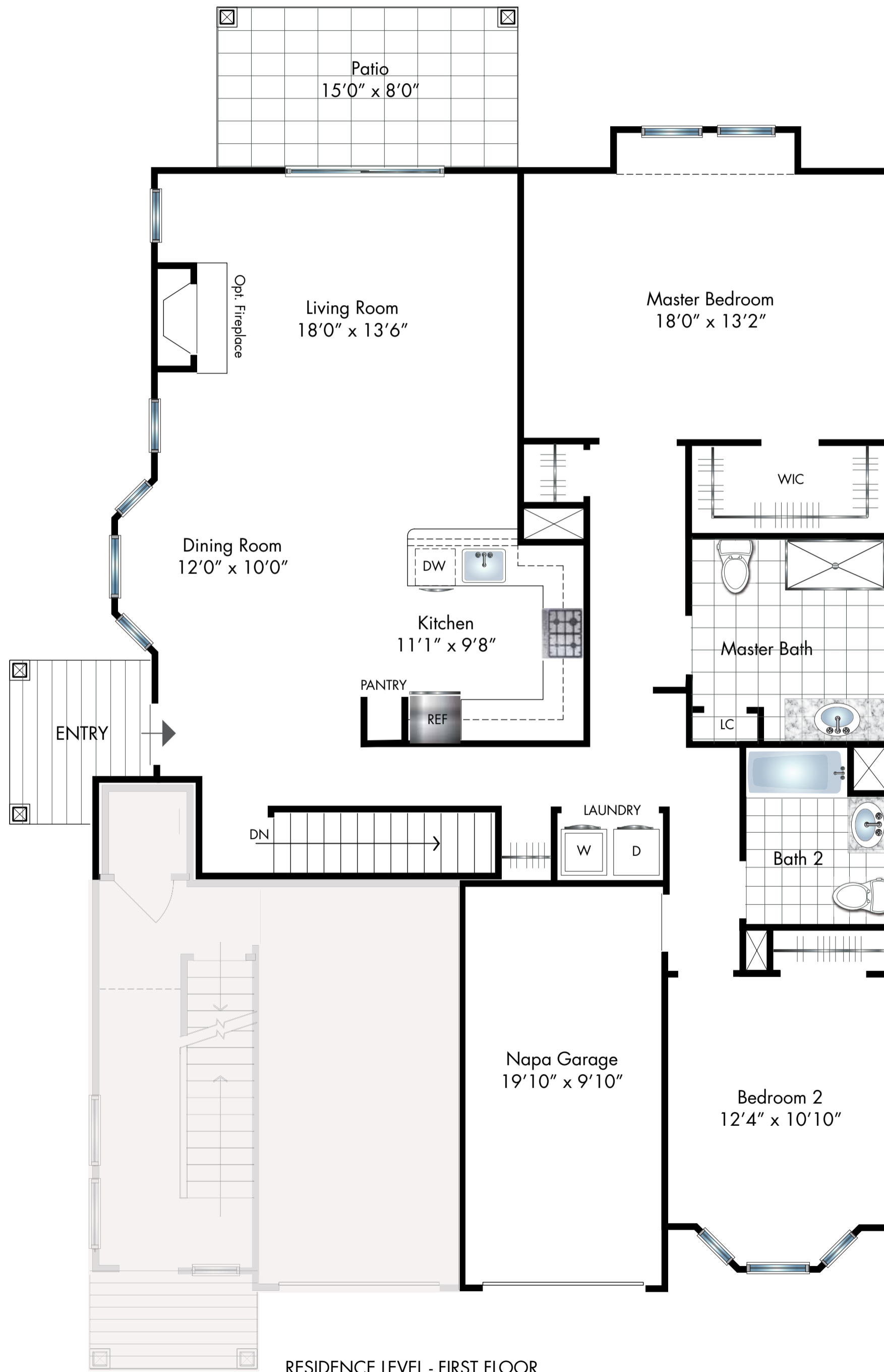
RESIDENCE LEVEL - FIRST FLOOR

2 Bedrooms • 2 Baths • Basement • Patio • Garage 1,557 Square Feet